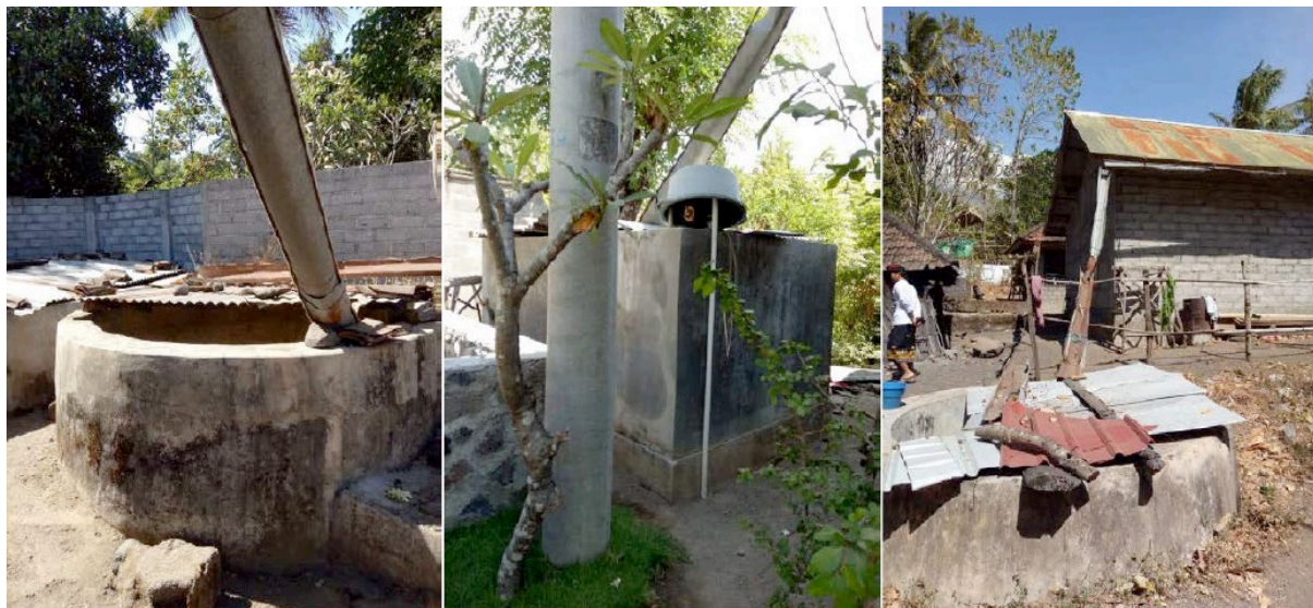
a. Cubang made of stone.