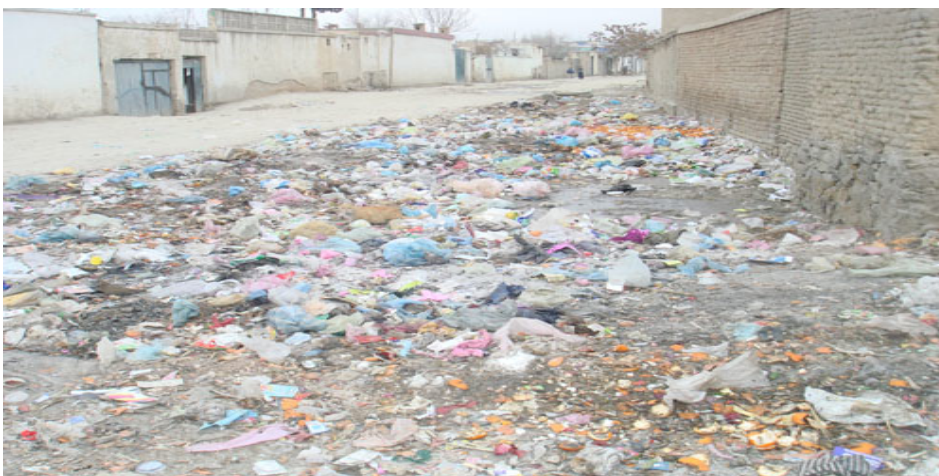
Figure 3: refuse dumping site within a residential location in Kabul with a human waste scavenger and explore.