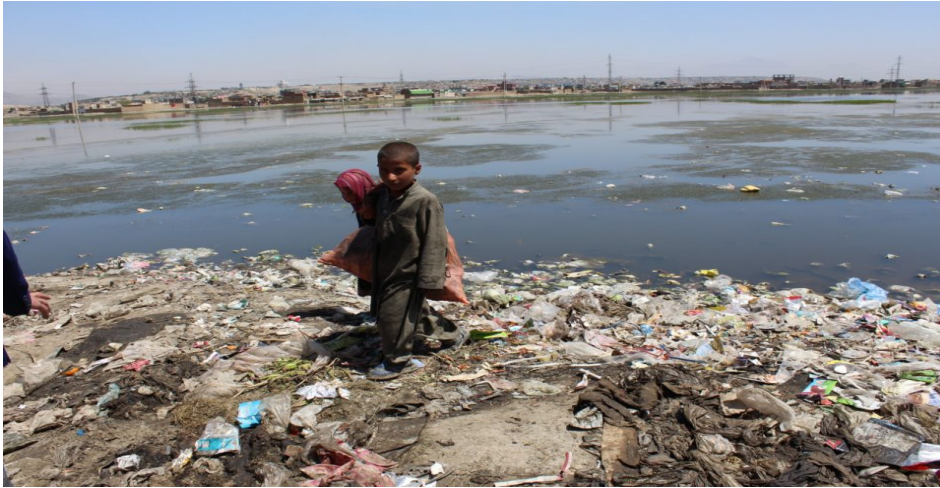
Figure 4: refuse dumping site within the human settlement in Kabul with a boy dumping refuse and scavenging animals.