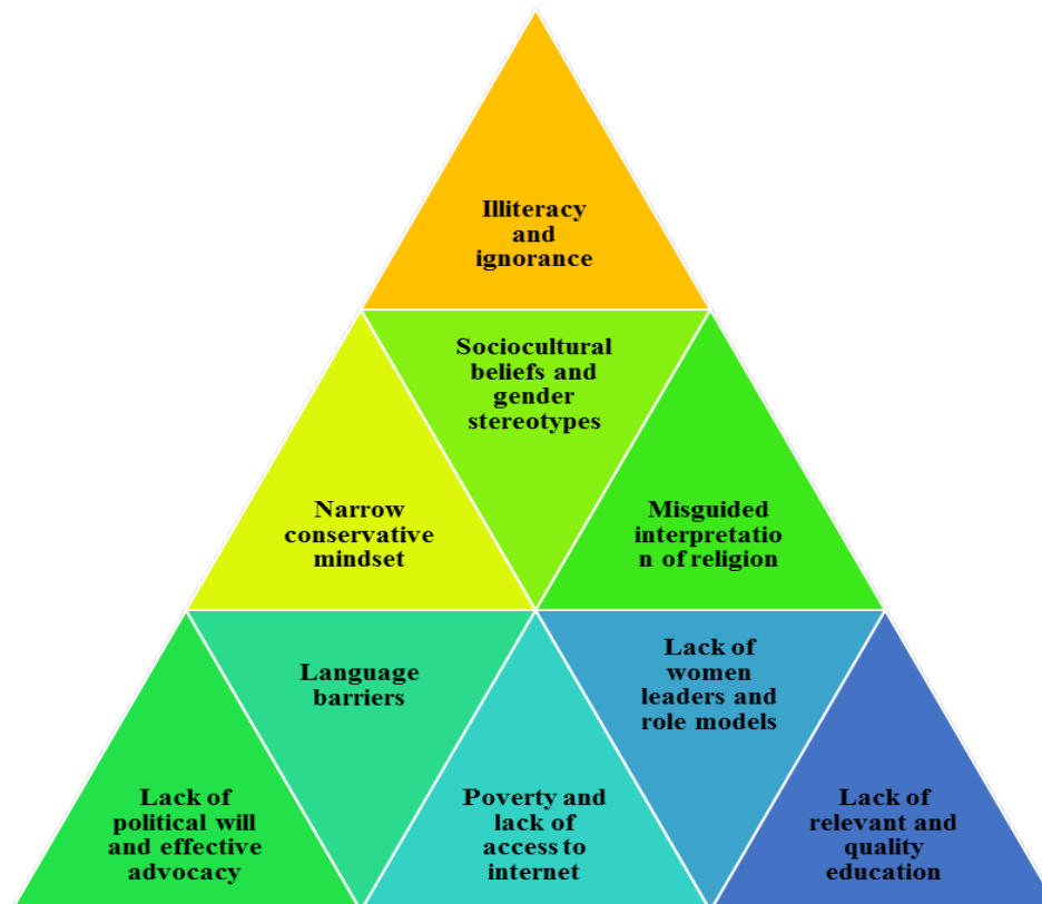
Diagram 2: Barriers to Girl-child education in Nigeria.

There are various factors that have been identified as barriers to the education of the girl-child. These are different depending on the countries and communities where the girls reside. There are some others which are relatively common to all climes.