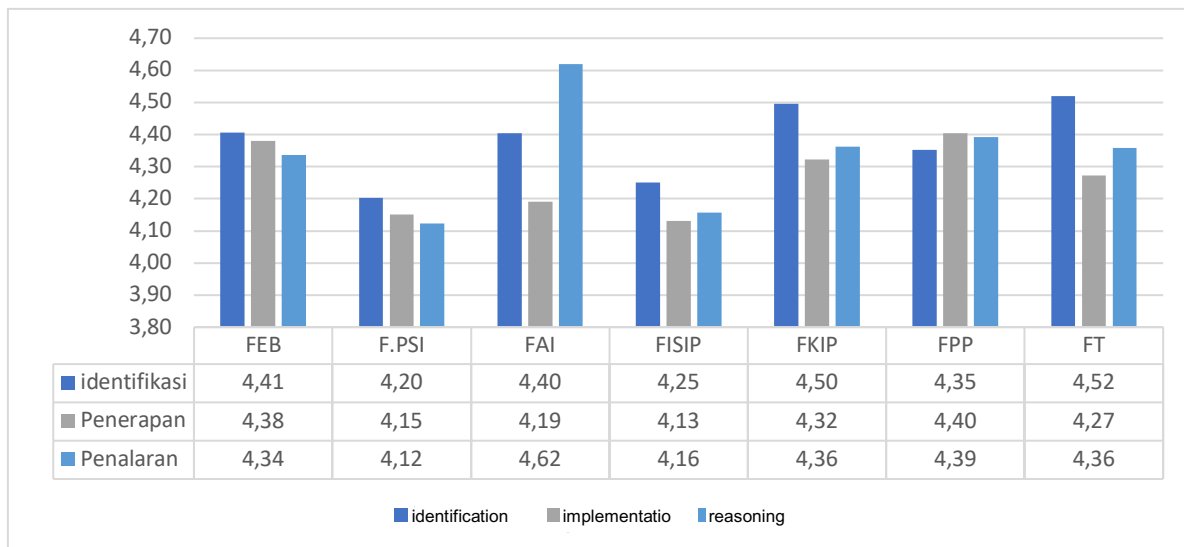
Figure 2: Human Emotional Literacy Level

The social aspect score is considered to provide opportunities for the development of the social skills of the academic community for network building and collaborative efforts (Sari, 2020). Network building requires reading of humanistic literacy from respondents in the form of emotional aspects that support individual traits, with each score per faculty, which are: identification (4.41), implementation (4.39), and reasoning (4.31).