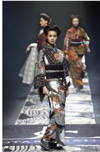
Figure 13. Tokyo fashion week, 2016. Public Domain.