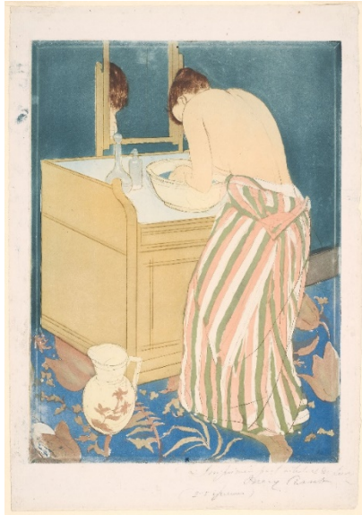
Figure 20. Mary Cassatt. Woman Bathing, 1891. The Art Institute of Chicago. CC0.