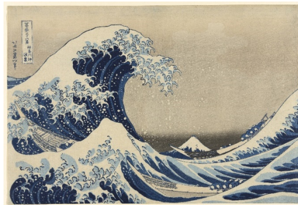
Figure 2. Katsushika Hokusai. Under the Wave off Kanagawa, 1833. The Art Institute of Chicago. CC0.

activities of historical heroes or as a theatrical backdrop. Hiroshige and Hokusai, on the other hand, used people merely as picturesque elements within vast, sublime panoramas (notice the tiny rowing figures at the bottom of figure 2) or as diminutive visitors to famous temples, monuments, or other sights.