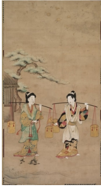
Figure 14. Scene from a Noh Play, ca. 1725. Kyoto School. The Cleveland Museum of Art. CC0.

Theater owners commissioned artists to create Kabuki actor prints (or yakusha-e ) to sell at play openings or for specific special performances. Today individual Kabuki actor prints can be very expensive, but originally theater promoters used them as inexpensive promotional items, as ephemeral souvenirs. They could be bought for the cost of a bowl of noodles. Artists also produced sets of prints for (more costly) banzuke , printed programs sold at kaomise , the ceremony that opened the new season of a Kabuki theater and introduced the new troupe of actors.