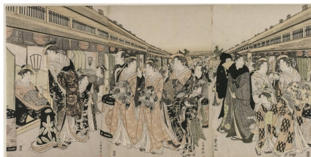
Figure 7. Utagawa Toyokuni (1769-1825). Courtesans Promenading on the Nakanocho. ca. 1790. Cleveland Museum of Art. CC0.

In Utagawa Toyokuni's late eighteenth century triptych (a three-sectioned artwork) (figure 7), three tayu and their attendants promenade down Nakanocho Street at sunset. An unaccompanied courtesan sits on a porch to the left, smoking a slender pipe, watching the procession. On the right, a samurai, concealing his identity behind a fan and hooded cloak, admires two courtesans pretending they do not notice his attention (The Cleveland Museum of Art (b) 2019). Perhaps this man of the ruling class did not want his face seen in Yoshiwara. After the government began requiring feudal lords to maintain a presence in Edo, their retinues started spending their time and money in Yoshiwara, away from the constraints of their provincial communities and families.