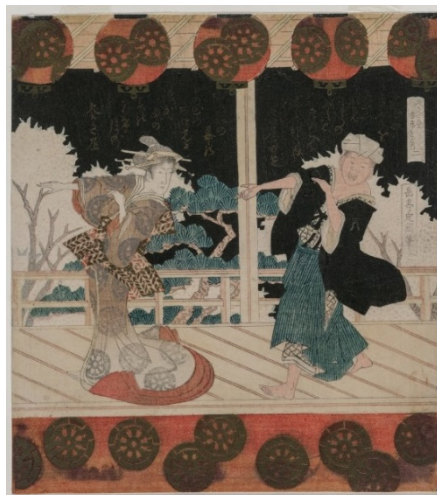
Figure 8 Yashima Gakutei. The Dance at Furuichi for the Hisagataya Group, ca. 1825. The Cleveland Museum of Art. CC0.

Authorities also censored poetry and other forms of literature (Suzuki 2012). Censors were especially wary of a type of ukiyo-e called uta-e , or "poem pictures." Uta-e images illustrated or captured the essence of poetic texts, which the artist wrote above or beside the image. In many ways, the playful form of verse called haikai no renga (or "comic linked verse") was the literary analogue to ukiyo-e imagery. The popular haikai form evolved in the sixteenth century from the traditional ushin renga poetic genre. In a similar way, the popular Kabuki theatrical genre evolved from the more aristocratic Noh theater. By the seventeenth century, chonin urbanites had embraced haikai's informal qualities and its use of the vernacular language of everyday life. Haikai poetry was celebrated and incorporated into woodblock prints called surimono , or "printed things." Friends and family members exchanged surimono as special gifts on important occasions such as holidays. Figure 8 is a surimono print showing the poet Hisagataya dancing with a geisha on the stage of a teahouse theater in the Furuichi district of Osaka. Hisagataya's poem is barely distinguishable in the print's black background.