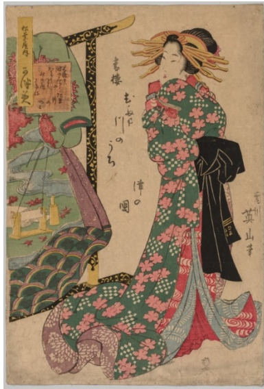
Figure 12. Kikugawa Eizan. Courtesan beside Kimono Rack, c. 1860. The Cleveland Museum of Art. CC0.

images into their advertisements. The cult-like celebrity of courtesans was somewhat akin to that of actresses, singers, and models of contemporary culture. Indeed, fashion trends continue to echo binjin-ga exemplars (figures 12, 13).