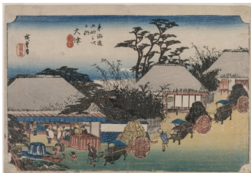
Figure 3 (left). Utagawa Hiroshige. The Fifty-Three Stations of Tokaido: Otsu. 1834. Cleveland Museum of Art. CC0.

Widespread urbanization began during the Edo Period, as Japan’s provincial castle towns grew into merchant cities. By 1800, Japan was one of the most urbanized countries in the world and Edo (the former name of Tokyo) was among the world’s most populated cities (Sorensen, 2002). “The river of life” described by Asai Ryoi frequently carried Japanese from the countryside into the urban areas of Edo, Kyoto, and Osaka. Ukiyo-e printmakers documented travelers’ journeys from the country into the city, and their stops along the way (figures 3, 4).