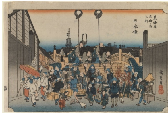
Figure 5. Utagawa Hiroshige. Fifty-three Stations of the Tokaido Road: Nihonbashi. 1833-1834.