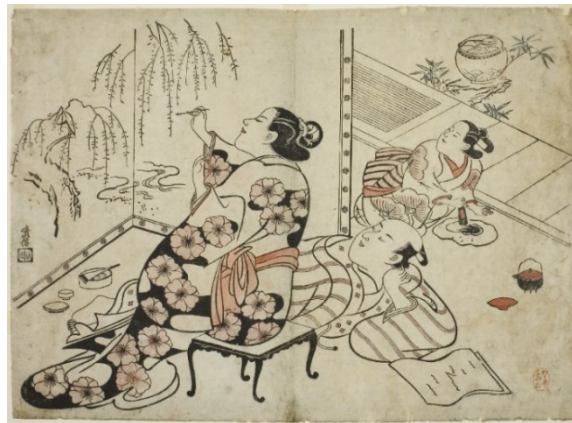
Figure 9. Torii Kiyonobu I. Courtesan painting a screen, ca. 1711. The Art Institute of Chicago. CC0.

Today, ukiyo-e prints are thought of as the individual works of the artist, but they usually resulted from the joint-efforts of a publisher, artist, carver, and printer. The publisher supervised the process, from the planning stage through the sale of the finished prints. Publishers commissioned artists to design a single image or series. When the artist was through, a carver (or horishi ) pasted the image onto a woodblock, usually cherry wood. Cherry woodblocks were favored for their hardness and durability; they could be printed many, many times. The carver incised the artist's contour lines into the key block with a sharp knife and dug out the areas that were not to be printed. A printer then inked the block with black ink called sumi and laid a dampened sheet, handmade from mulberry pulp, on top. The printer (or surishi ) then transferred the impression by rubbing the paper with a baren. The key block impression established the outlines and guide marks ( kento ) for the application of subsequent colors. The first woodcuts were monochromatic, black impressions, although hand coloring could be applied (see figure 9). Full-color prints (called nishiki-e ), became common in the 1760s. For each additional color, the carver carved a separate block, which the printer rubbed with the new color and transferred onto the key block impression (see Folks 2018). Producing ukiyo-e prints could be a quite laborious process.