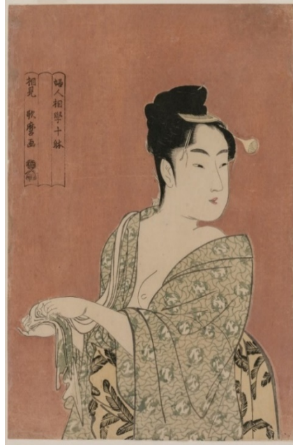
Figure 11. Kitagawa Utamaro (ca. 1753-1806). Woman Drying her Hands, from the set Ten Types in the Physiognomic Study of Women, c. 1793.