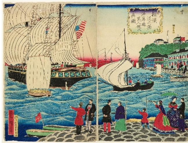
Figure 19. Utagawa Hiroshige III (1842-1894). True View of Yokohama, 1875.