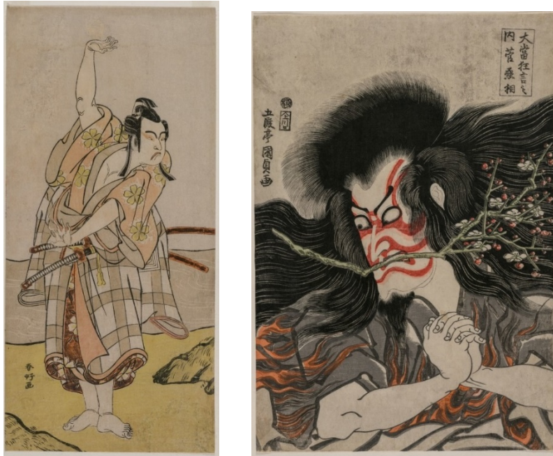
Figure 15. Katsukawa Shunko (1743-1812). Actor Ichikawa Yaozo. The Cleveland Museum of Art. CC0.