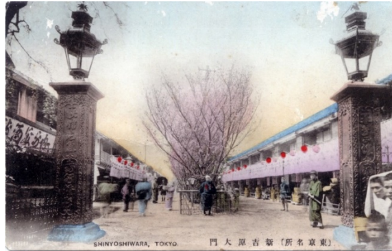
Figure 6. Postcard showing Yoshiwara Great Gate, ca. 1910. Public Domain.

Edo's Yoshiwara was the largest and, arguably, the most culturally significant yukaku . Edo (meaning "entrance to the bay") grew rapidly from an obscure fishing village into one of the world's largest cities. The founder of the Tokugawa shogunate, Tokugawa Ieyasu chose Edo as his headquarters in 1590. By 1720, there were one million inhabitants. By 1750, there were one and a half million. Edo's densely congested districts fostered a vibrant urban culture.