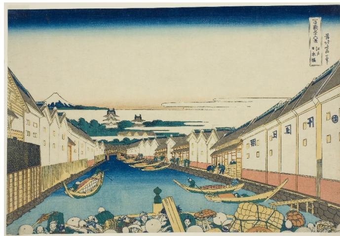
Figure 18. Katsushika Hokusai. Nihonbashi, Edo, from Thirty-Six Views of Mount Fuji, 1830s. The Art Institute of Chicago. CC0.

Japan’s period of isolation lasted until 1853, when American Navy Commodore Matthew Perry (1794-1858) landed in Edo Bay and used gunboat diplomacy to force Japan to open its ports to American trade. When Yokohama’s port opened to foreign trade in 1859, artists of the Utagawa school came to feed a local demand for images of the foreign visitors pouring into the city. The artists created a sub-genre of ukiyo-e, called Yokohama-e , by fusing Japanese printmaking traditions with novel aspects of western art (figure 19). Yokohama-e was produced even after the Tokugawa shogunate came to an end and practical imperial rule resumed under the Meiji Restoration (1867-1868). Figure 19 is a Meiji Period landscape, rather than an Edo Period landscape. It shows an American clipper , a type of merchant sailing ship, leaving Yokohama harbor laden with merchandise headed for a European or American port of trade.