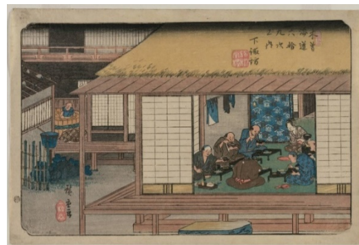
Figure 4 (right). Utagawa Hiroshige. The Sixty-Nine Stations of Kisokaido: Shimosuwa. 1838. Cleveland Museum of Art. CC0.