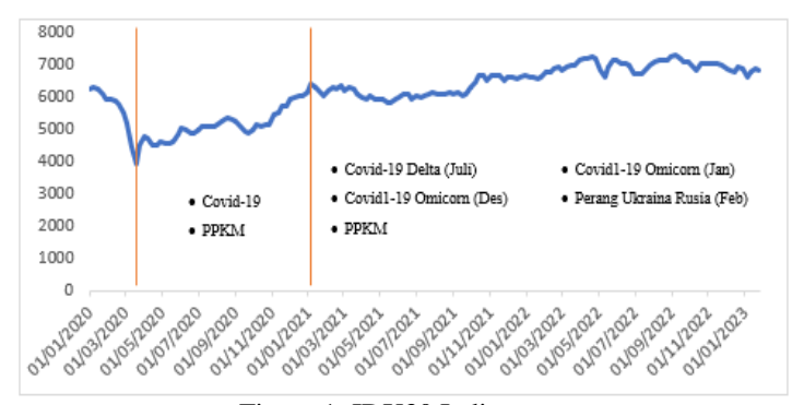
Figure 1: IDX30 Indices

Muhammad Adisurya (2020) highlighted that the Covid-19 pandemic triggered a crisis worldwide, affecting various sectors, including finance. Indonesia's Financial Services Authority (OJK) reported a severe blow to the composite stock price index, with a significant decline in stock prices. At the beginning of 2020, stock prices hovered around 6300 but dropped to 3900 by March 2020. Additionally, trading volume also decreased from 36.5 billion in 2019 to 27.4 billion in 2020. Factors influencing the capital market during the Covid-19 pandemic included speculation related to government stimulus measures and responses from central banks.