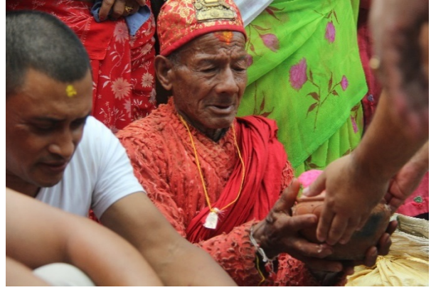
Figure 6. Worship of the rice to be offered to the priests (left) and rice being offered to the priests of Bajracharya and Shakya caste (right)