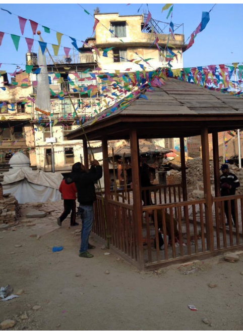
Figure 7. Fodder being offered to the cow and hoisting of the flag on top of the temporary structure to protect the idol after the earthquake

Both Ta Chata Guthi and Sa Guthi acknowledged the role heritage played after the earthquake and how it is important to highlight its role in bringing communities together after the earthquake. Both guthis have kept the festivals associated with Kasthmandap alive even if the structure itself collapsed. This highlights the importance of heritage in a post-disaster setting.