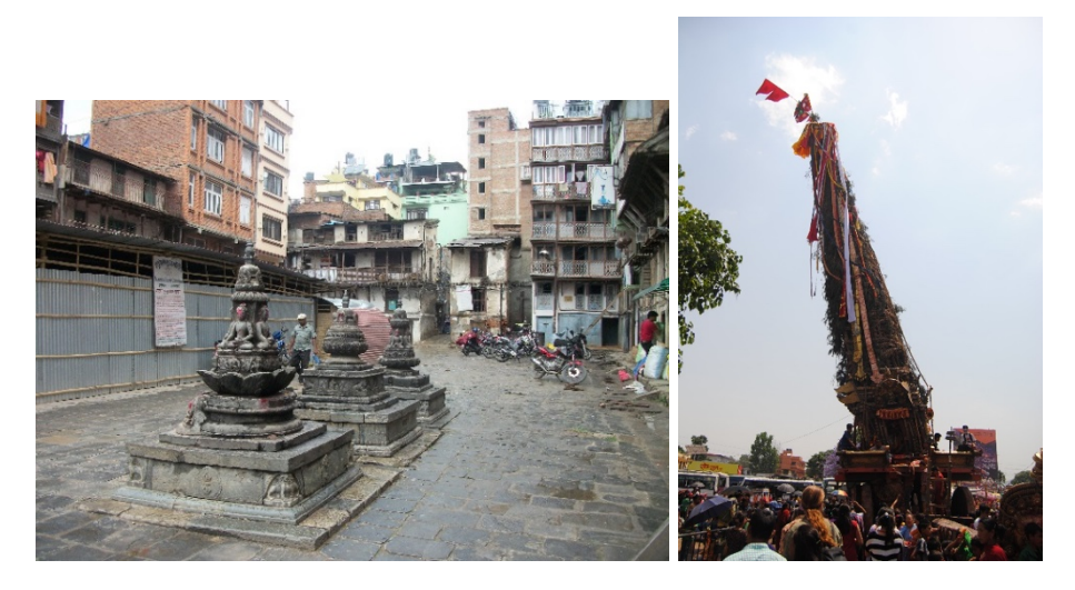
Figure 2. A typical neighbourhood in the core area (left) and Rato Machhendranath Festival (right)

Urban pattern of the core consists of two basic elements; blocks of closely built two to three storey houses clustered around courtyards and a network of streets and pedestrian lanes. The squares and alleyways are home to many temples, dance platforms, wells and public rest houses. Almost all neighbourhoods have a temple for its own Ganesh and a shrine for its area protector. Each divinity presides over a particular territory and every year each deity is led out in procession (Silva, 2015). In addition, daily rituals and activities along with tangible heritage make the Kathmandu Valley a living heritage site. Figure 2 shows examples of the tangible and intangible heritage in the valley.