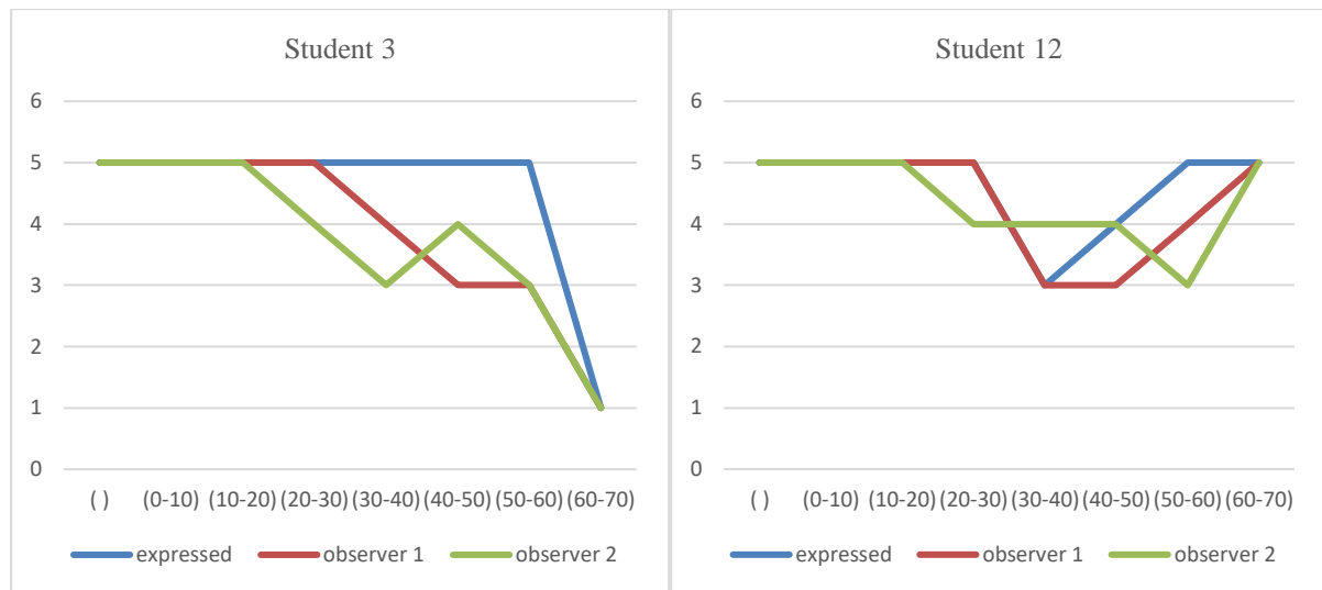
Figure 2: Pairwise comparison of SI

To be able to more specifically examine the overall graph, it may be useful to examine the individual SI change graphs of students who were selected as examples. Accordingly, the individual SI graphs of four students considered to be information-rich are presented comparatively below.